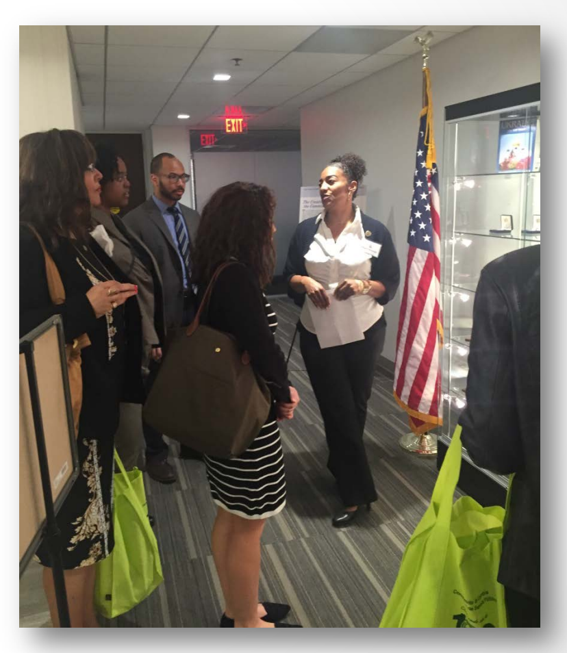
Attendees Take Tour of PSC