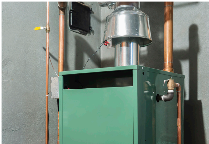
Furnaces/Boilers/Hot Water Heaters

for Income-Qualified Seniors & Residents with Disabilities